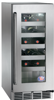
Glass Door Model