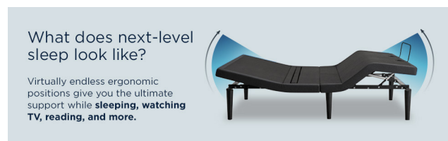
Enhanced Content (EC2)