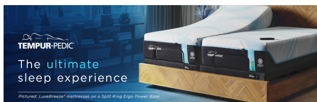
Enhanced Content (EC1)