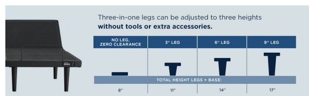
Enhanced Content (EC4)

Images and graphics shown here are not to scale. Files included in the PDP packet will be sized as noted above.