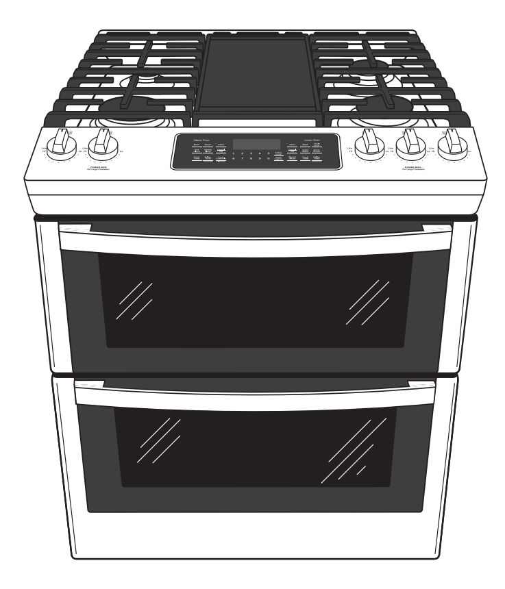
Visit geappliances.com for more info