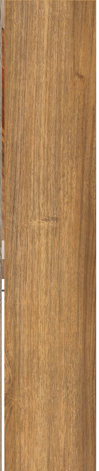
507 Dakota Walnut