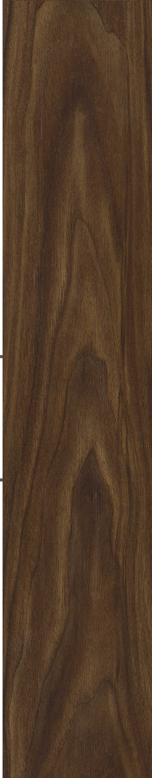
503 Black Walnut