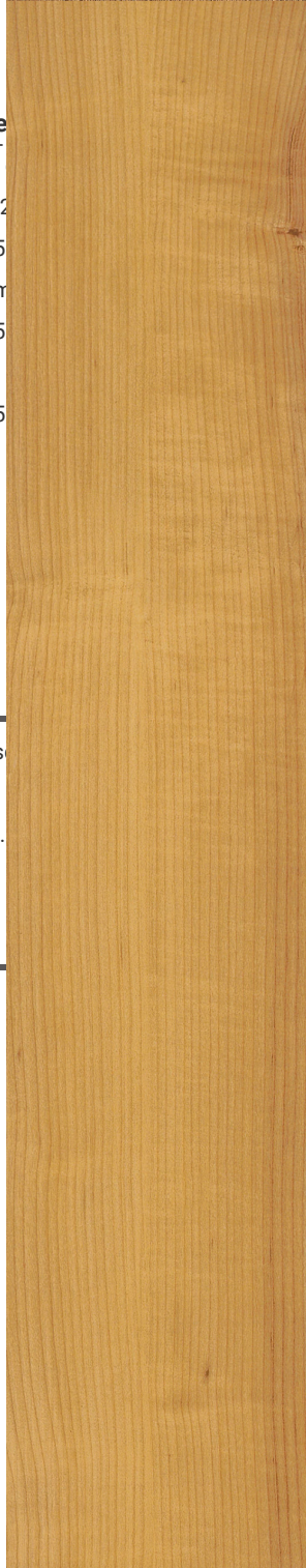
505 Norwegian Maple