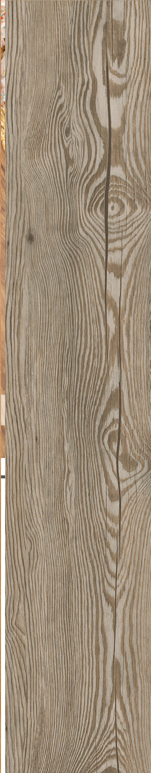
506 Corvallis Pine