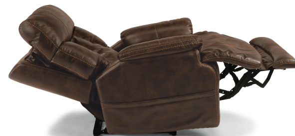
Fabric Power Recliner with Power Headrest 1594-50PH in 374-70