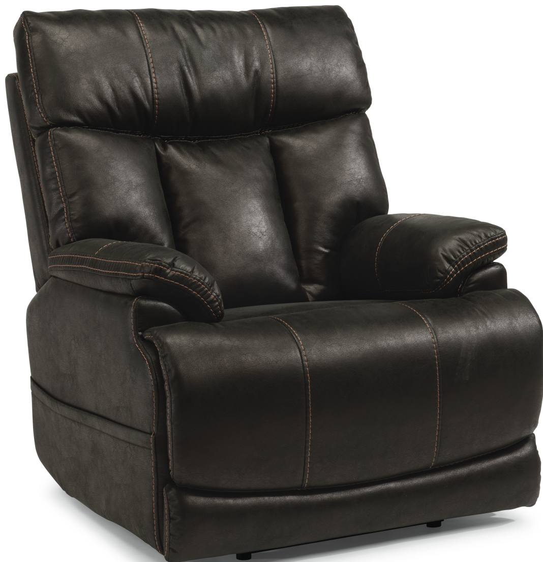
Fabric Power Recliner with Power Headrest 1594-50PH in 374-00