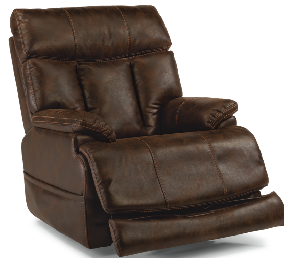
Fabric Power Recliner with Power Headrest 1594-50PH in 374-70