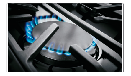
Power Burner Power Burner offers more power and faster boil time with 17,000 BTU burner.