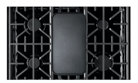
CustomFlex<sup>™</sup> Cooktop with Griddle and Oval Burner

Evenly heat and cook pancakes, hamburgers, or quesadillas on the CustomFlex™ Cooktop that includes a Center Oval Burner and cast iron griddle.