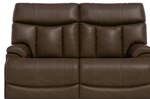
1594-60PH in Fabric 374-70