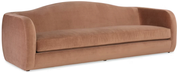
Fabric shown: MV036-78

Frame Construction: Our M upholstered furniture collection pieces are benchmade from sustainably sourced wood and upholstered start to finish by our skilled craftspeople in both North Carolina and Virginia. Every piece has been thoughtfully designed for today's modern lifestyle. Frames are constructed of sustainably certified kiln dried engineered hardwood. Frame parts are joined with precision cut interlocking joints that are glued, stapled to reduce movement, twisting and warping. Frames have cornerblocks that are glued and screwed at stress points, especially on seat rails and other high stress areas. Depending on rail thickness, frames may be of a hybrid