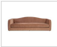
Fabric shown: MV036-78