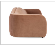
Fabric shown: MV036-78