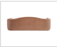
Fabric shown: MV036-78