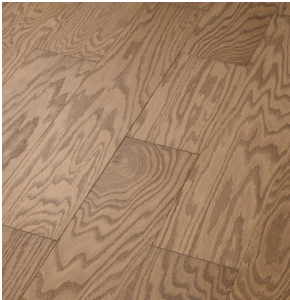
2028 Art Deco