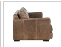
Leather shown: ML1005-88 Emery Anchor Finish: Perk