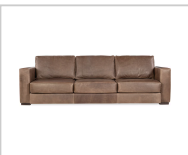
Leather shown: ML1005-88 Emery Anchor Finish: Perk