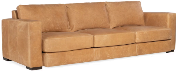
Leather shown: ML1002-85 Skylen Butternut Finish: Perk