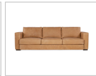
Leather shown: ML1002-85 Skylen Butternut Finish: Perk