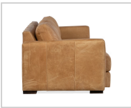
Leather shown: ML1002-85 Skylen Butternut Finish: Perk