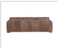
Leather shown: ML1005-88 Emery Anchor Finish: Perk