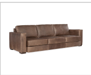
Leather shown: ML1005-88 Emery Anchor Finish: Perk