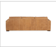
Leather shown: ML1002-85 Skylen Butternut Finish: Perk

Features: Wide track arm design Block wood feet