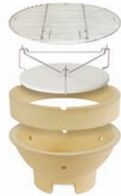
Roasting “Bottom” configuration.