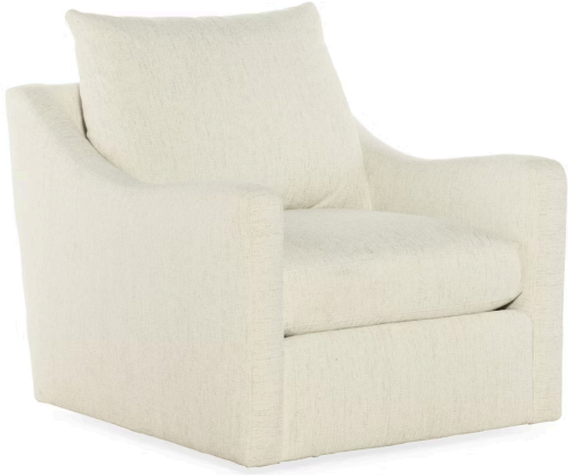
Fabric shown: 400558-04 Knife Edge Back shown

HF Custom Furniture www.hfcustomfurniture.com