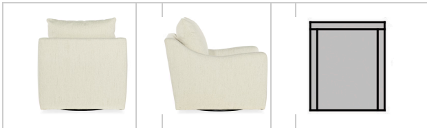
Fabric shown: 400558-04 Knife Edge Back shown