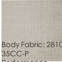
Body Fabric: 2810- 35CC-P Performance