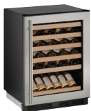
STAINLESS FRAME (LOCK)