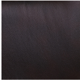
Molasses 629-70 Fabric