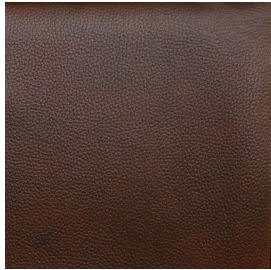
Pumpernickel 629-72 Fabric

Printed samples may vary from actual swatches. Please refer to swatches for actual color.