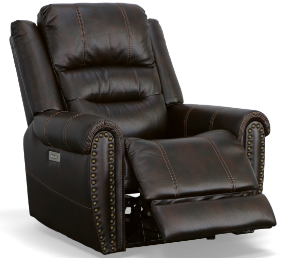
1590-50PH in Fabric 629-70