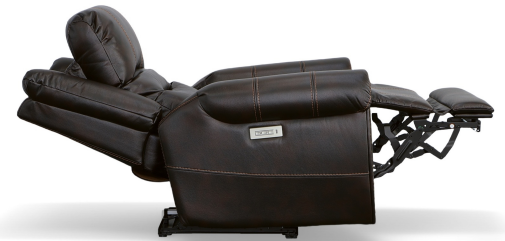
1590-50PH in Fabric 629-70