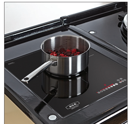
9" x 9" Defined Pan Area