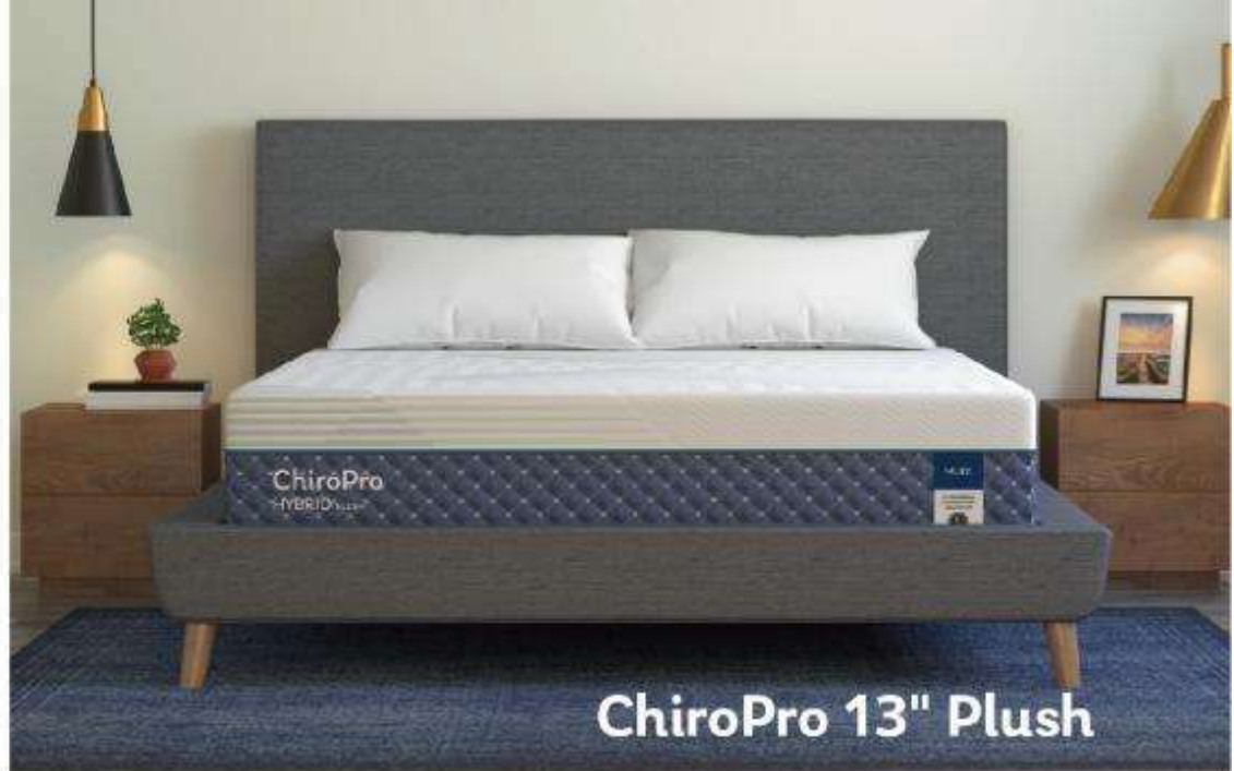
ChiroPro 13" Plush