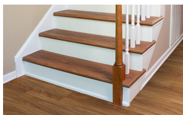
g Stair Treads