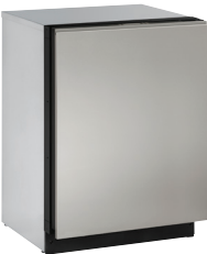
INTEGRATED SOLID (STAINLESS HANDLELESS PANEL)*