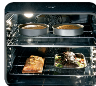
Flex Duo™ Oven