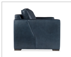
Leather shown: 927100-48 Finish: Cobblestone