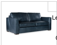
Leather shown: 927100-48 Finish: Cobblestone