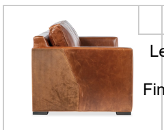
Leather shown: 928000-86 Finish: Plantation