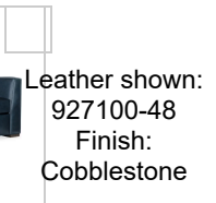
Leather shown: 927100-48 Finish: Cobblestone