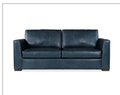
Leather shown: 927100-48 Finish: Cobblestone