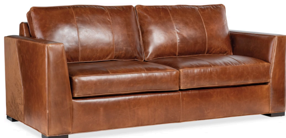
Leather shown: 928000-86 Finish: Plantation