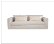
Fabric shown: MB037-05 Contrasting Pillow: MV0001- 04