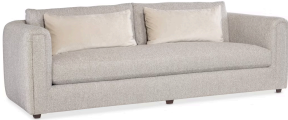
Fabric shown: MB037-05 Contrasting Pillow: MV0001-04

Frame Construction: Our M upholstered furniture collection pieces are benchmade from sustainably sourced wood and upholstered start to finish by our skilled craftspeople in both North Carolina and Virginia. Every piece has been thoughtfully designed for today's modern lifestyle. Frames are constructed of sustainably certified kiln dried engineered hardwood. Frame parts are joined with precision cut interlocking joints that are glued, stapled to reduce movement, twisting and warping. Frames have cornerblocks that are glued and screwed at stress points, especially on seat rails and other high stress areas. Depending on rail thickness, frames may be of a hybrid