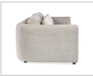
Fabric shown: MB037-05 Contrasting Pillow: MV0001- 04