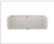
Fabric shown: MB037-05 Contrasting Pillow: MV0001- 04