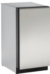
INTEGRATED SOLID (STAINLESS HANDLELESS PANEL)*