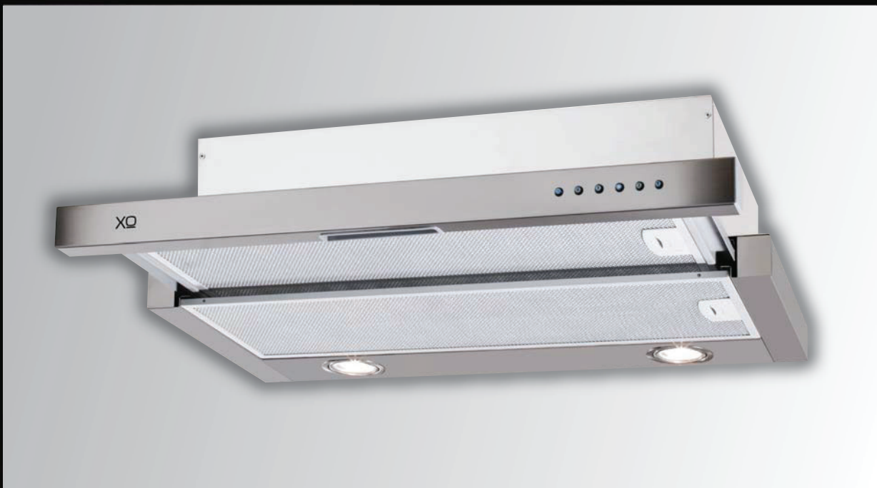
Under Cabinet - Glide Out