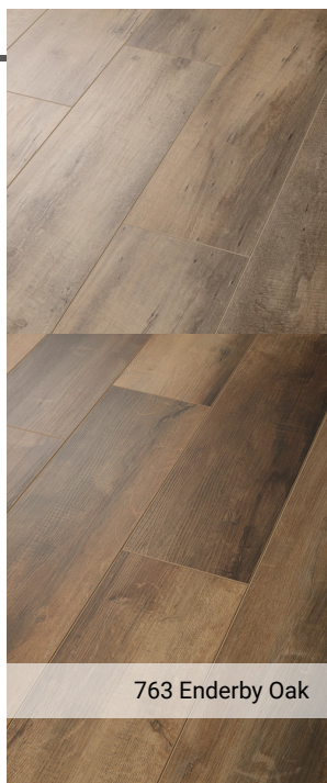
763 Enderby Oak