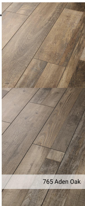
765 Aden Oak