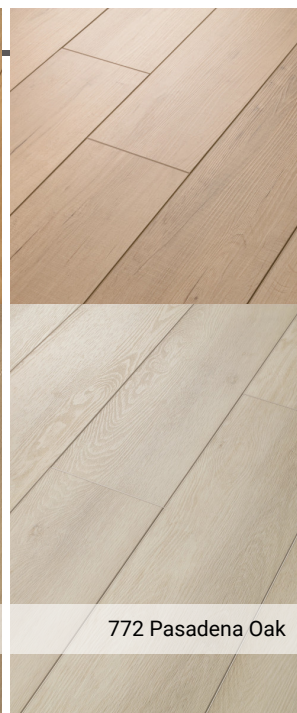
772 Pasadena Oak