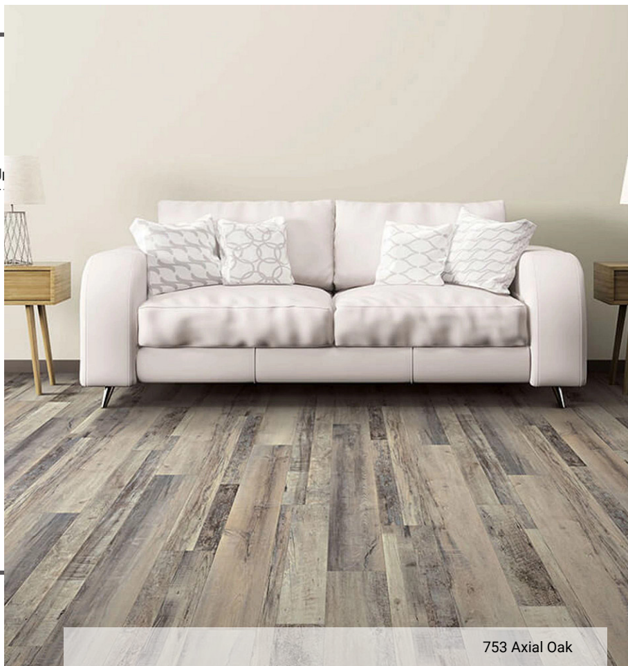
753 Axial Oak