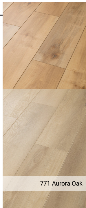
771 Aurora Oak