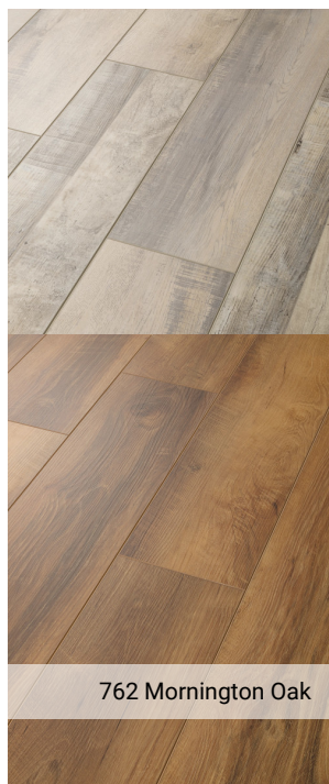
762 Mornington Oak