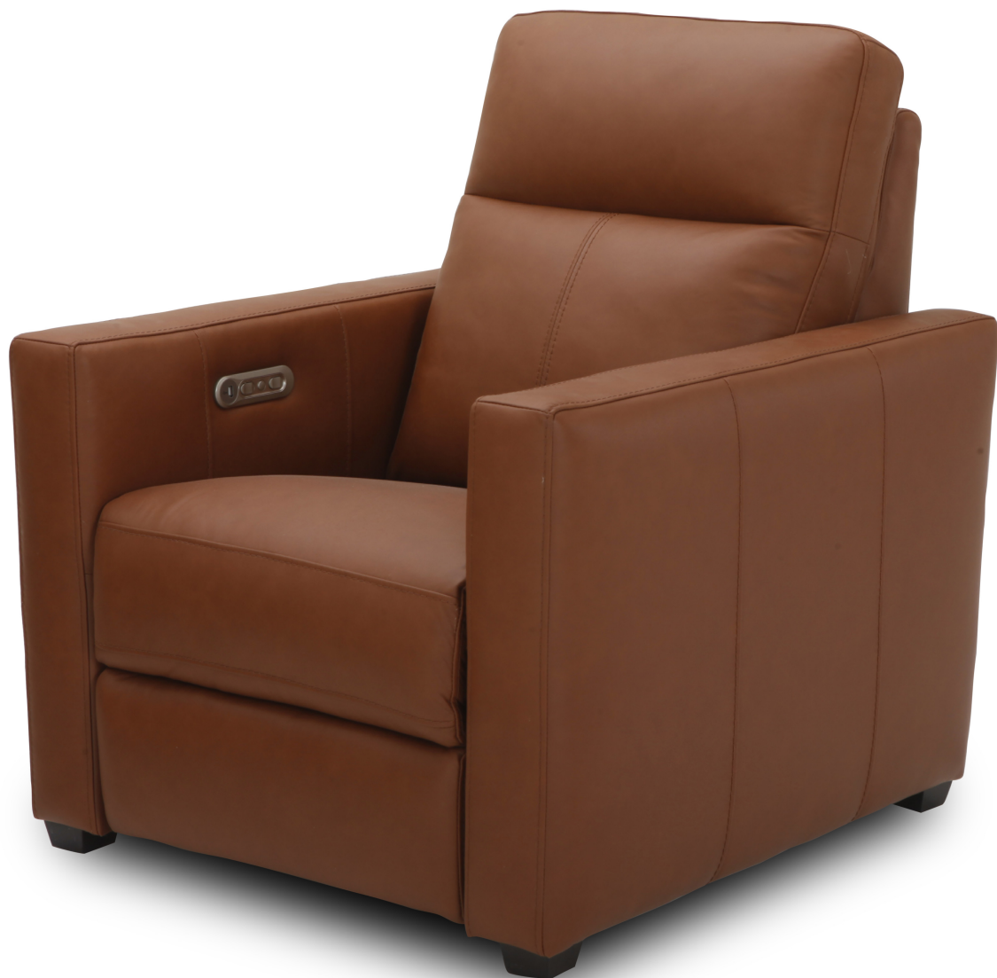
1032-50PH in leather 943-71