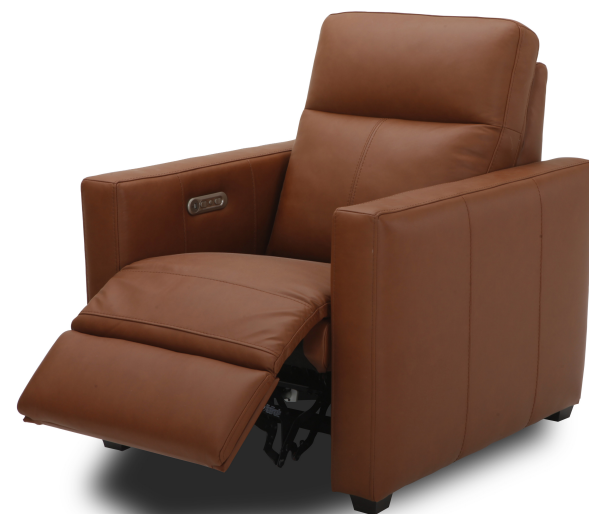
1032-50PH in leather 943-71