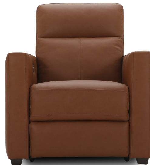
1032-50PH in leather 943-71