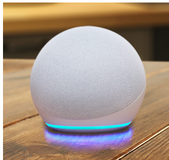
Works with Alexa allows for effortless verbal control over your microwave