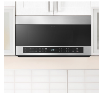
The sleek edge-to-edge stainless steel and black glass design is an elegant look to your kitchen

Product specifications and design are subject to change without notice.