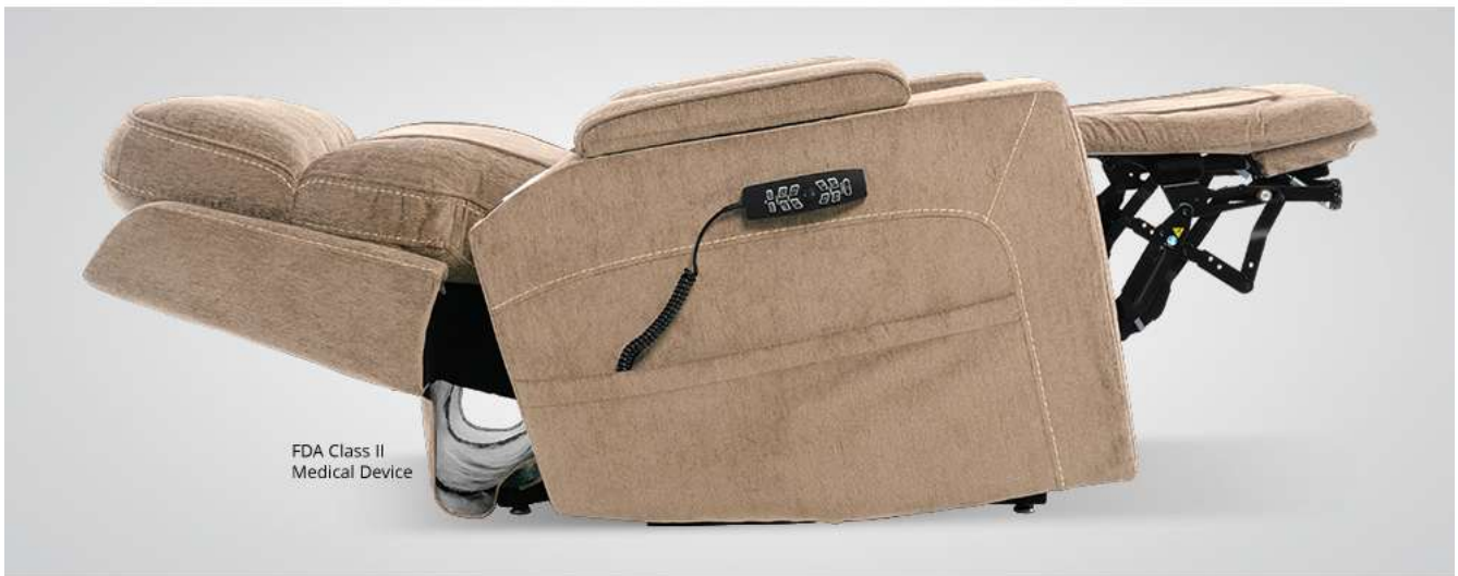
FDA Class II Medical Device