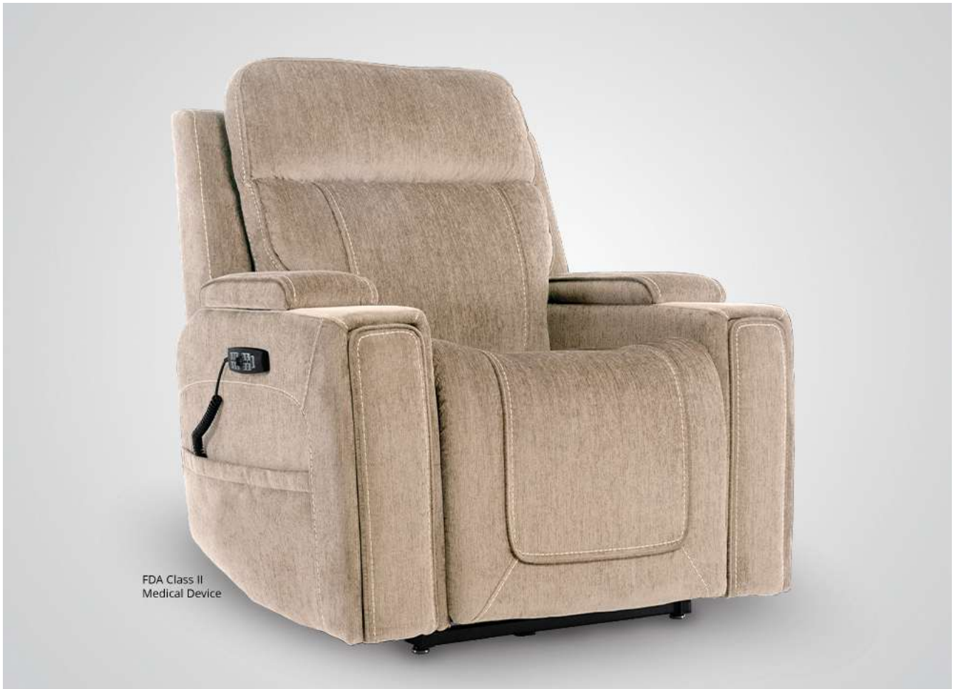
FDA Class II Medical Device