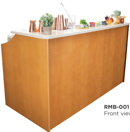
RMB-001 Front view