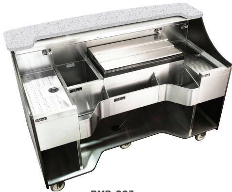
RMB-003 70" Mobile Bar with 2 drainboards