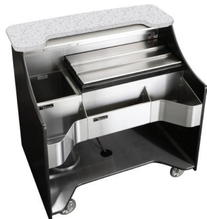
RMB-004 46" Mobile Bar

perlick.com/residential-design-solutions