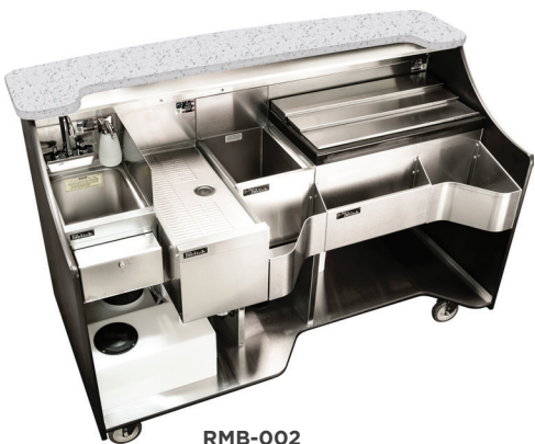
RMB-002 70" Mobile Bar with drainboard and sink configuration