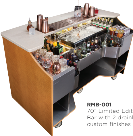
RMB-001 70" Limited Edition Mobile Bar with 2 drainboards and custom finishes