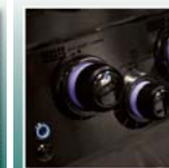
Built In Control Panel Lights