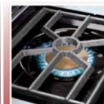
Commercial Grade Side Burner