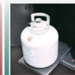
Pull Out Tank Drawer