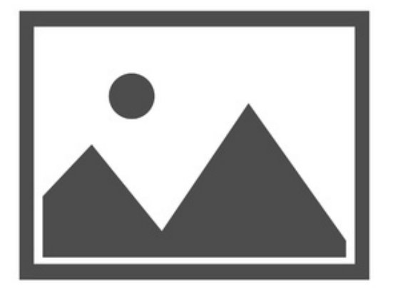
No image available

General Dimensions: Metric 42" W x 42" D x 25" H