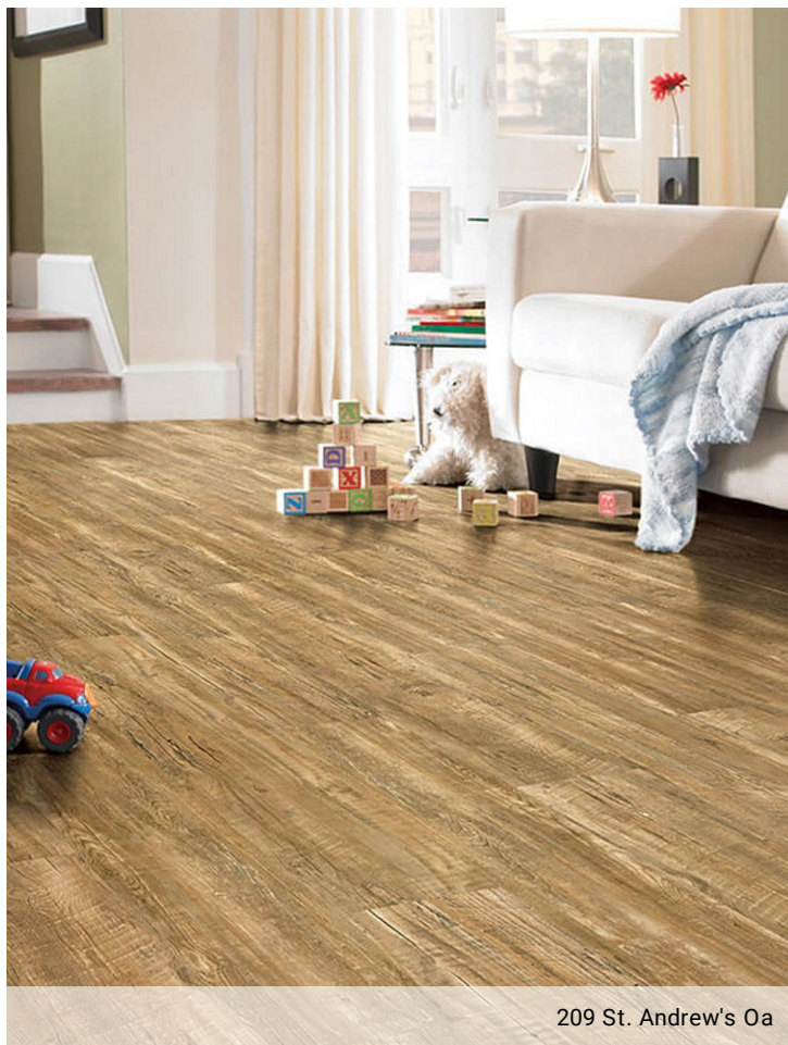
209 St. Andrew's Oa