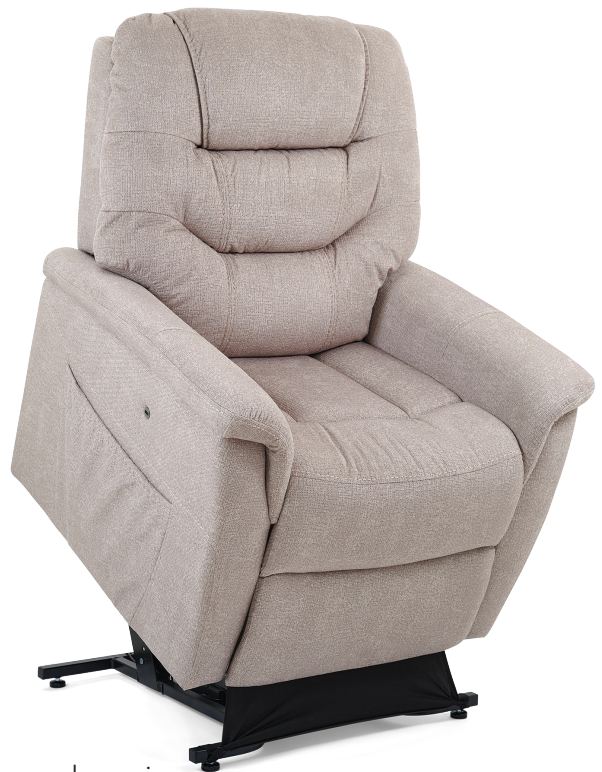
shown in Antler