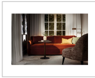
Fabric shown: MM004-78 Monroe Cinnamon Finish: Ebony