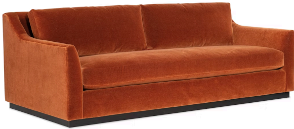
Fabric shown: MM004-78 Monroe Cinnamon Finish: Ebony

Frame Construction: Our M upholstered furniture collection pieces are benchmade from sustainably sourced wood and upholstered start to finish by our