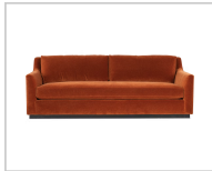
Fabric shown: MM004-78 Monroe Cinnamon Finish: Ebony