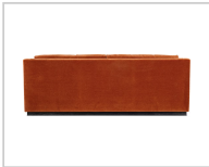
Fabric shown: MM004-78 Monroe Cinnamon Finish: Ebony