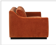
Fabric shown: MM004-78 Monroe Cinnamon Finish: Ebony