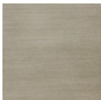
Smoked Stainless Steel Paint