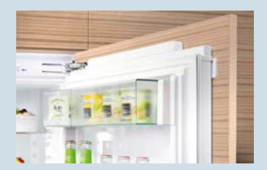
Door-on-door technology: Allows custom panels to be affixed directly onto the appliance so that the hinges are concealed, plus the cabinet and the fridge open as one, ensuring a wide range of design options and easy installation.