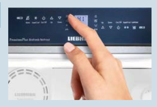
SuperCool/SuperFrost: Simply quick chill and/or freeze fresh groceries to preserve optimum freshness and seal in flavors, textures as well as maintain essential vitamins and minerals.

* Energy Cost will depend on utility rates and use. Estimated energy cost based on a national average electricity cost of 12 cents per KWh. ** Noise output - according to EN 60704-3