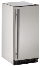
STAINLESS SOLID (LOCK)