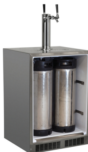
Two Sixth Barrels or Cornelius Kegs