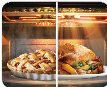
Power Convection/PowerGrill Duo™