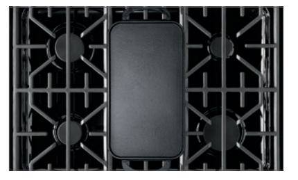
CustomFlex™ Cooktop with Griddle and Oval Burner

Evenly heat and cook pancakes, hamburgers, or quesadillas on the CustomFlex™ Cooktop that includes a Center Oval Burner and cast iron griddle.