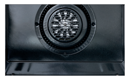
True Convection A third heating element and single convection fan circulate hot air throughout the oven for faster and more even multi-rack baking.