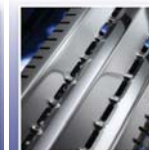
Stainless Steel Flav-R-Wave™ Cooking System