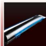
Stainless Steel Tube Burner System