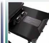
Steel Side Shelf With Integrated Tool Hooks