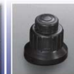
Sure-Lite™ Electronic Ignition System