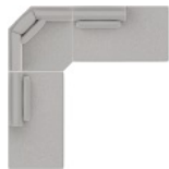
20/9W/19 117 x 117" 298 x 298 cm