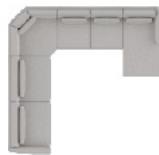
A2/9W/90/15 147 x 140" 374 x 356 cm