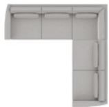
B2/9B/B3 116 x 116" 295 x 295 cm