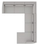
B4/90/15 112 x 135" 285 x 343 cm