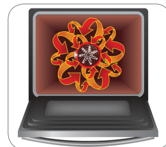
True Convection Oven