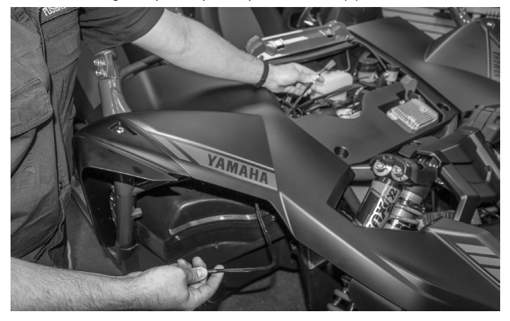
Take the speaker wire harness and run from the RFYXZ-K8 or RFYXZ-PMXDK harness under the hood to the holes drilled in the foot well.