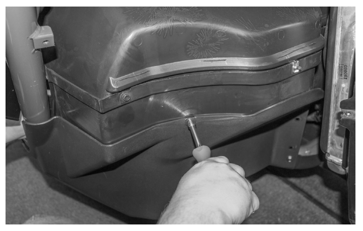
Using the (2) bolts removed from the inside of the vehicle, secure the pod in place from the wheel well side.

Temporarily install the speaker pod into the foot well area to mark the holes that will need to be drilled