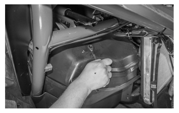
Install using the supplied bolt through the top of the enclosure. The bolt will go through the drilled 5/16" hole. Secure with the supplied nut.