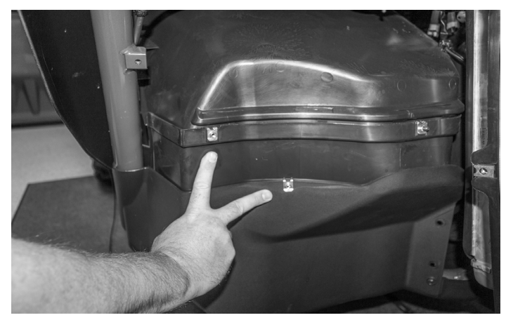
Remove the (2) spring nuts from the panels once the bolts are out of the way using a pick tool or small flat blade screwdriver.