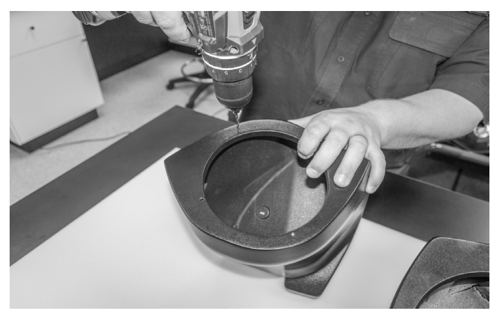
Next prep the speaker pods by drilling the holes in pods. The pods come with the mounting hole locations already marked. Use 1/8" bit to clean out the holes to prevent damaging the screws or enclosures.