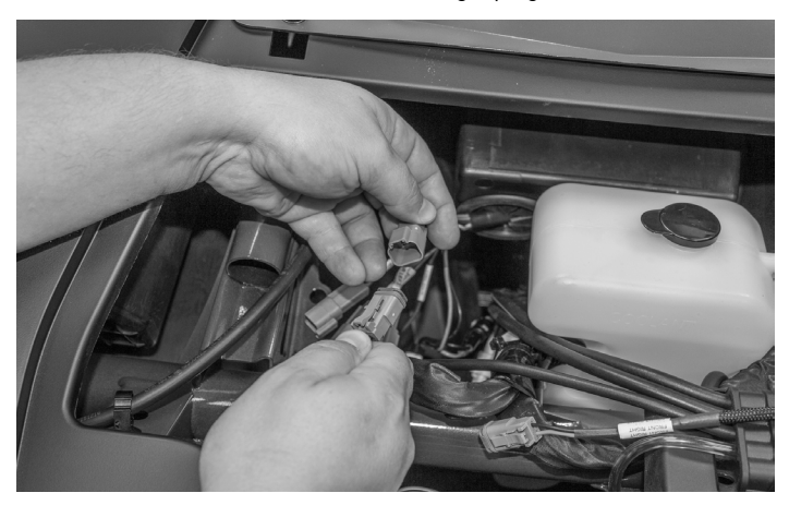
Connect the speaker harnesses to the output plugs paying attention to the left and right speaker labels.

Once both speaker pods are installed and the harnesses are ran, locate the front speaker output connections in the RFYXZ-DK radio harness or the RFYXZ-K8 harness and remove the watertight plugs.