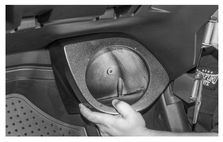
Step 4 - Mount Speaker Enclosures Remount the pod into the foot well location.