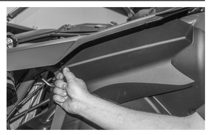
Once the connections are made, test the system to verify functionality. After testing, secure the wire harnesses with plastic wire ties and reassemble the vehicle.

NOTE: After the speaker is secured repeat the installation process for the opposite speaker pod on the other side.