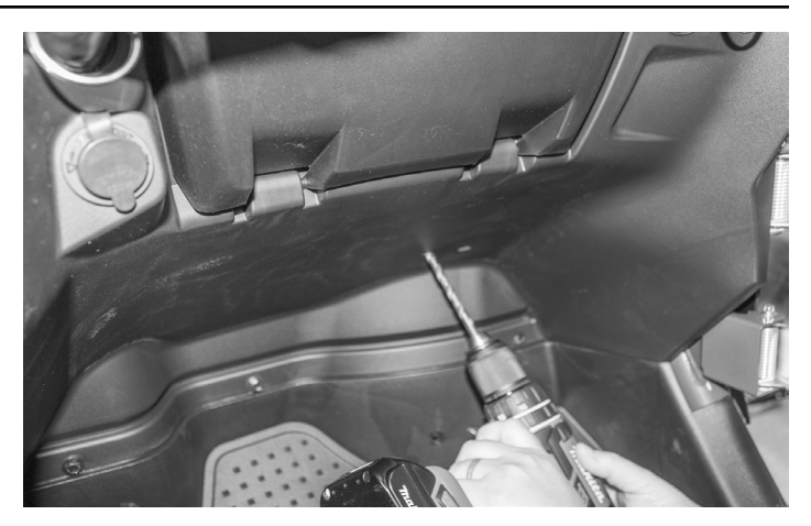
Remove the pod and drill (2) holes in the firewall using a 5/16" and 1/2" drill bit.