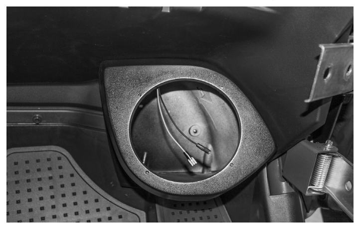
Attach the speaker wire harness connectors to the speaker terminals.

NOTE: Be sure leave adequate wire length to attach the speaker.