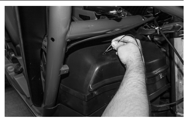
Feed the speaker wire harness through the 1/2" hole.