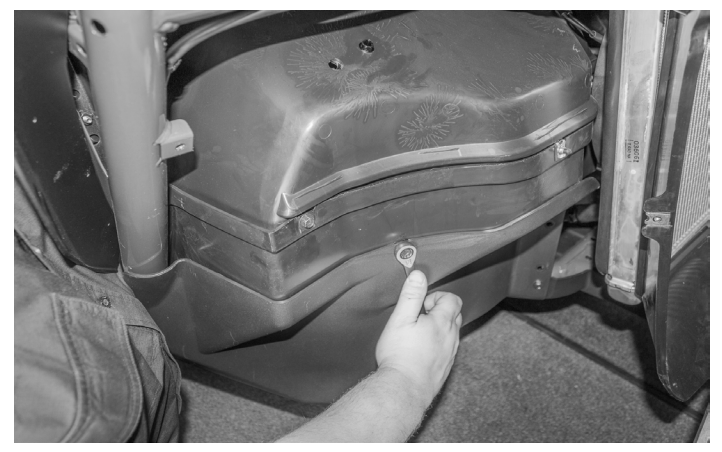
Finish securing the speaker pod in place with the (2) bolts used earlier.