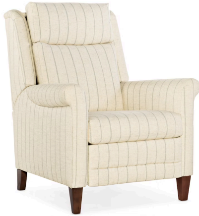
Fabric shown: 600333-40 (no longer available) Finish: Palisade Dark

Frame Construction: Furniture grade laminated h durability which eliminates bowing or warping. Construction features include an