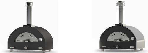
Black Powder Coat Stainless Steel