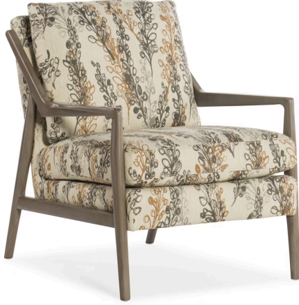
Fabric shown: 300291-78 (no longer available) Finish shown: Truffle