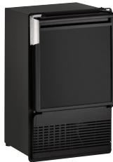
BLACK SOLID (FLANGE TO CABINET)