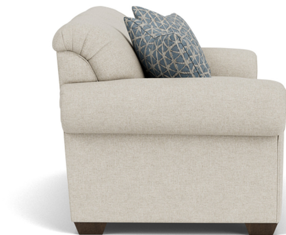
5988-44 in Fabric 818-11