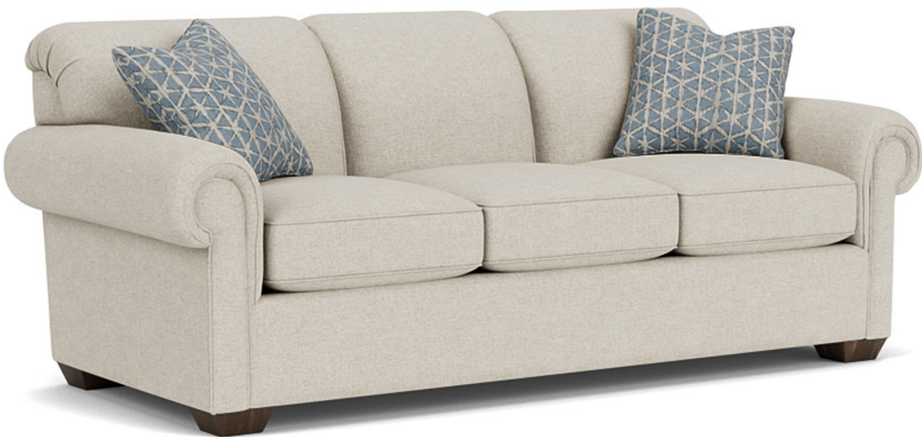
5988-44 in Fabric 818-11