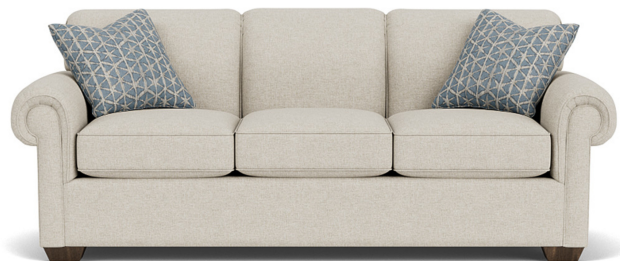
5988-44 in Fabric 818-11