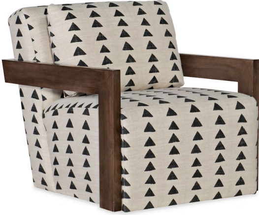
Fabric shown: 200308-99 Finish: Weathered