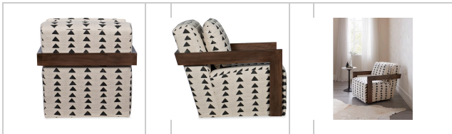
Fabric shown: 200308-99 Finish: Weathered Fabric shown: 200308-99 Finish: Weathered